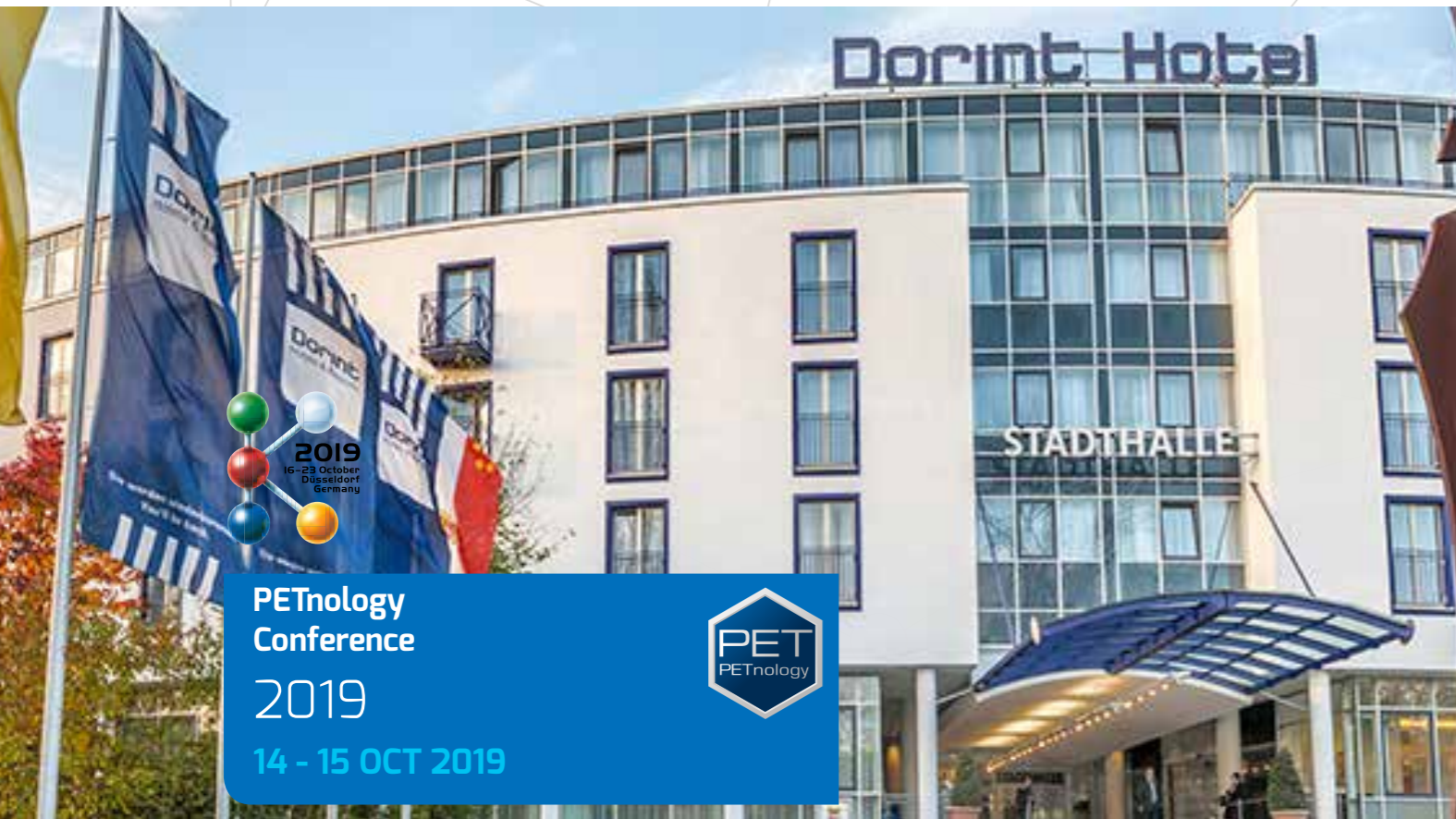
TABLE TOP EXHIBITION CONFERENCE

PETnology Europe 2019: 14 - 15 October 2019 K-Show: 16 - 24 October 2019